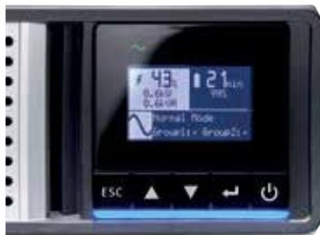
Intuitive LCD display for ease of configuration and management